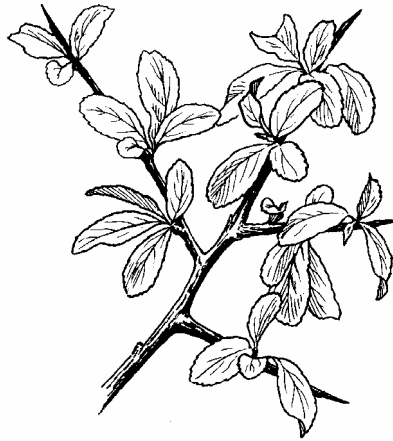
Blackthorn Prunus spinosa (Illustration by Charlotte Matthews)

red-belted clearwing Synanthedon culciformis and this feeds under the bark of birch trees. Newly emerged adults have been found on stumps of cut trees in May and June. We have planted numerous buckthorns to encourage brimstone butterflies.